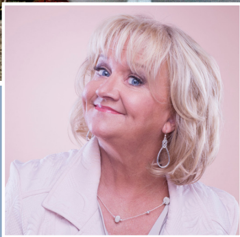
Featured Entertainer Chonda Pierce